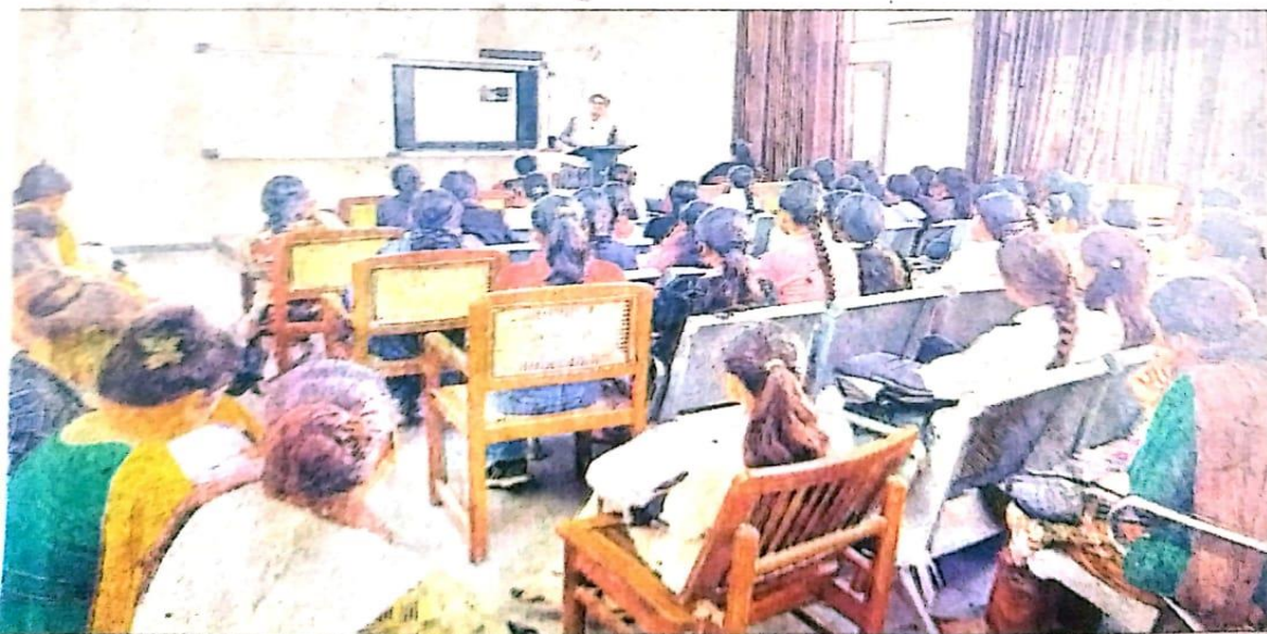
व्याख्यान में भाग लेती छात्राएं।