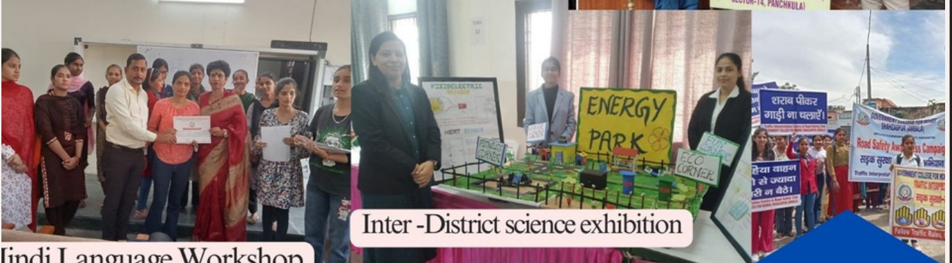
Inter -District science exhibition