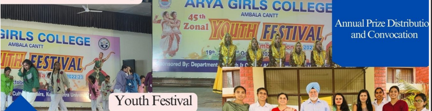
Annual Prize Distribution and Convocation