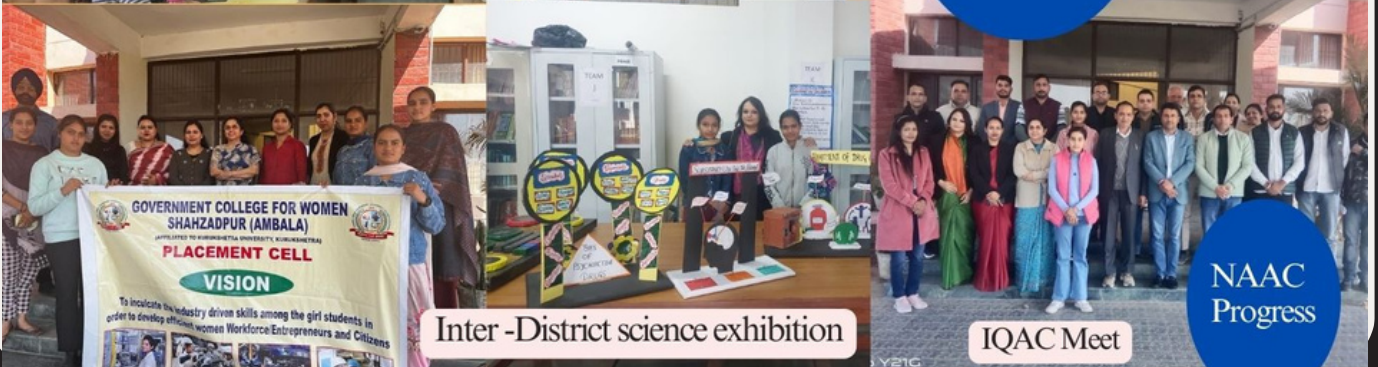
GOVERNMENT COLLEGE FOR WOMEN SHAHZADPUR (AMBALA) AFFILIATED TO GURUMATEL UNIVERSITY, KARNAL (HARYANA) PLACEMENT CELL VISION To inculcate the industry driven skills among the girl students in order to develop efficient women Workforce/Entrepreneurs and Citizens